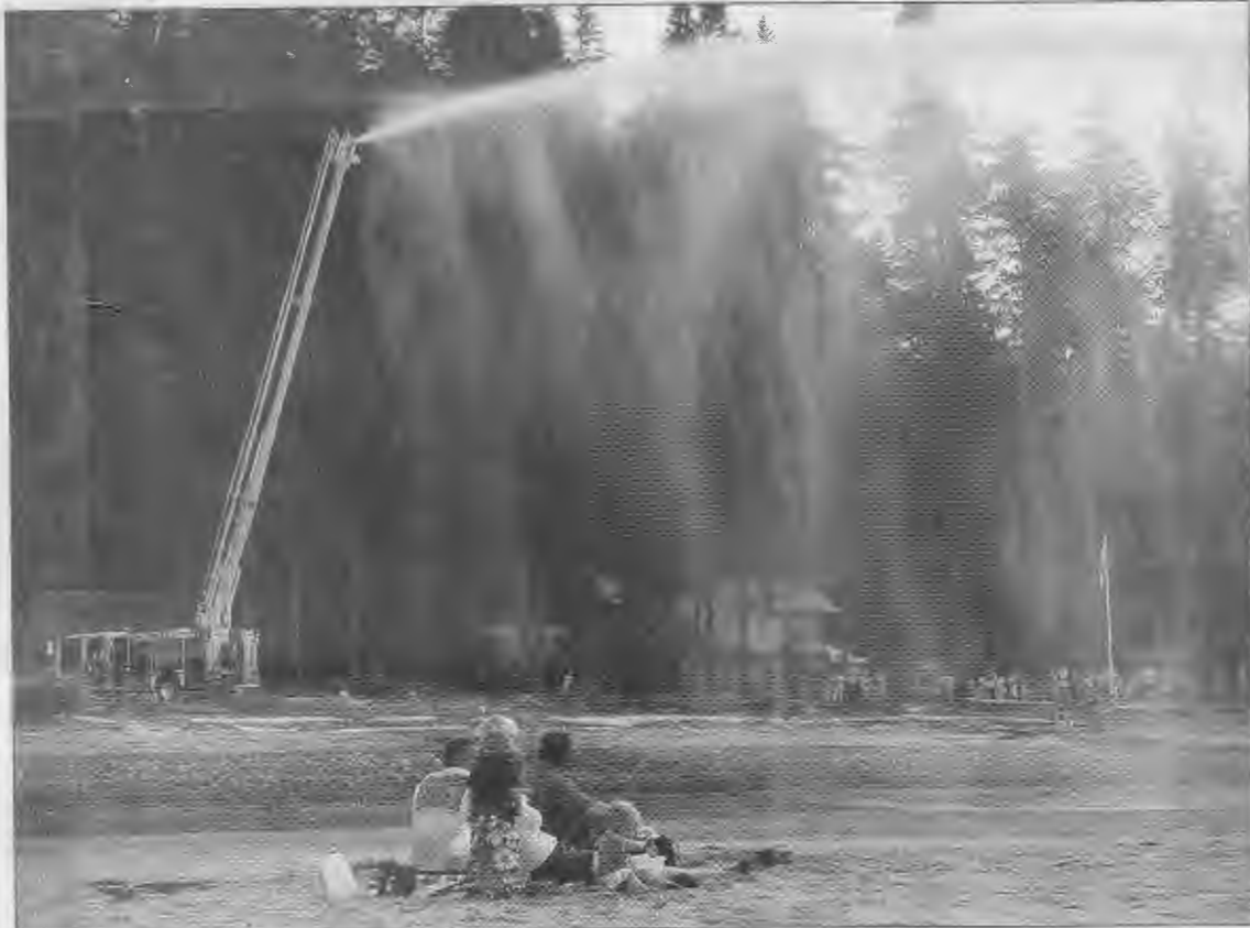
A Comox fire truck sprays a curtain of water over the beach off Kye Bay in a demonstration of the community's new fire-fighting capabilities. The event was part of Saturday's celebration of Kye Bay's new water and sewer system.